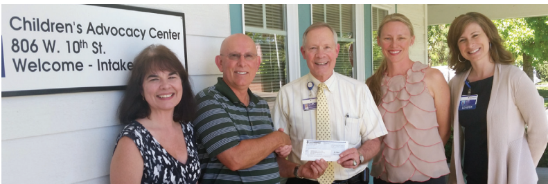
Thank you to Providence for their donation of $10,000 to our Caring for Kids Campaign.

Save the date for this annual event. We sold out last year! The theme is Moroccan Nights and we look forward to another great evening full of supporters and friends.